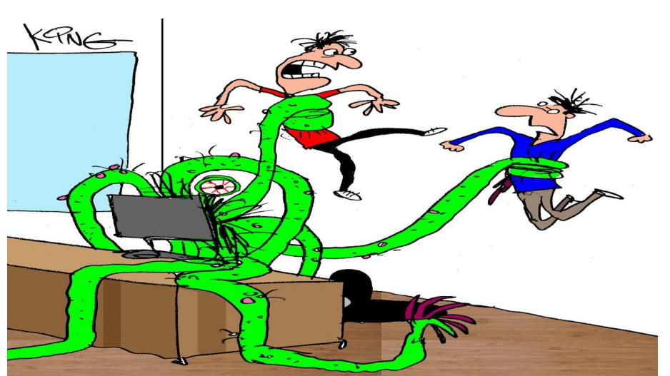
''Next time you get a strange email with a paperclip, don't click on it!"

■ Taking Action After Receiving A Bad Review You've built up your business, trained your team