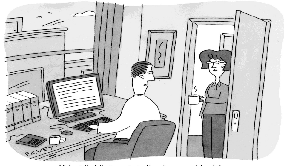
"I just feel fortunate to live in a world with so much disinformation at my fingertips."

If you've seen success with certain marketing trends in the past, you don't have to get rid of them when you develop a new marketing strategy.